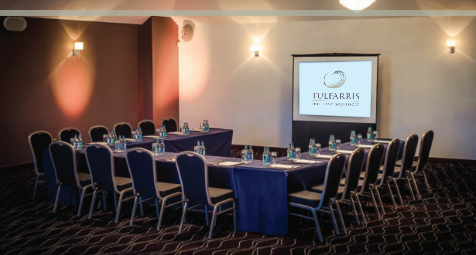
MEETING AND EVENT SPACE